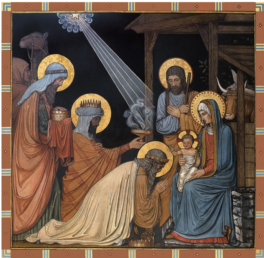
A Beuronese mural of the Visit of the Magi, Conception Abbey, Missouri (1893-1897)