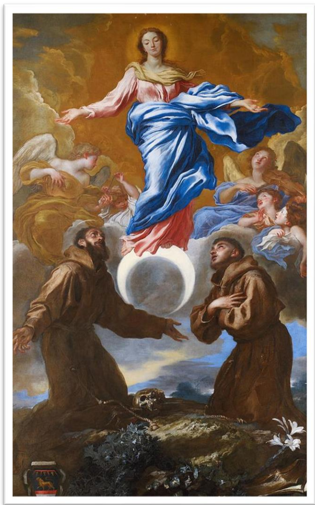
The Immaculate Conception with Saints Francis of Assisi and Anthony of Padua by Il Grechetto (1650)